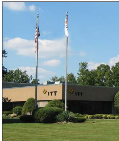
ITT Enidine Inc. Orchard Park, NY