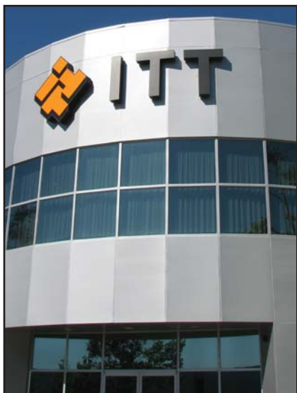
Control Technologies Headquarters Valencia, CA