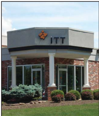
Cleveland Motion Controls Cleveland, OH

ITT is a vibrant part of the global economy. We are a high-technology engineering and manufacturing company with approximately 40,000 employees operating in 55 countries. Our portfolio of businesses is aligned with enduring global growth drivers, and our employees bring extraordinary focus to meeting the needs of the people who buy and use our products and services in all the markets we serve.